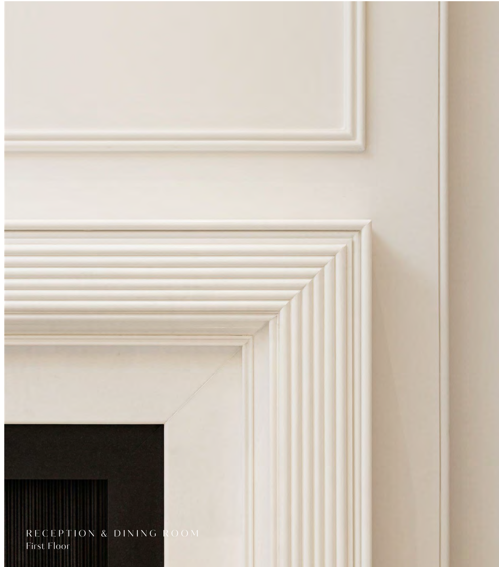
RECEPTION & DINING ROOM First Floor