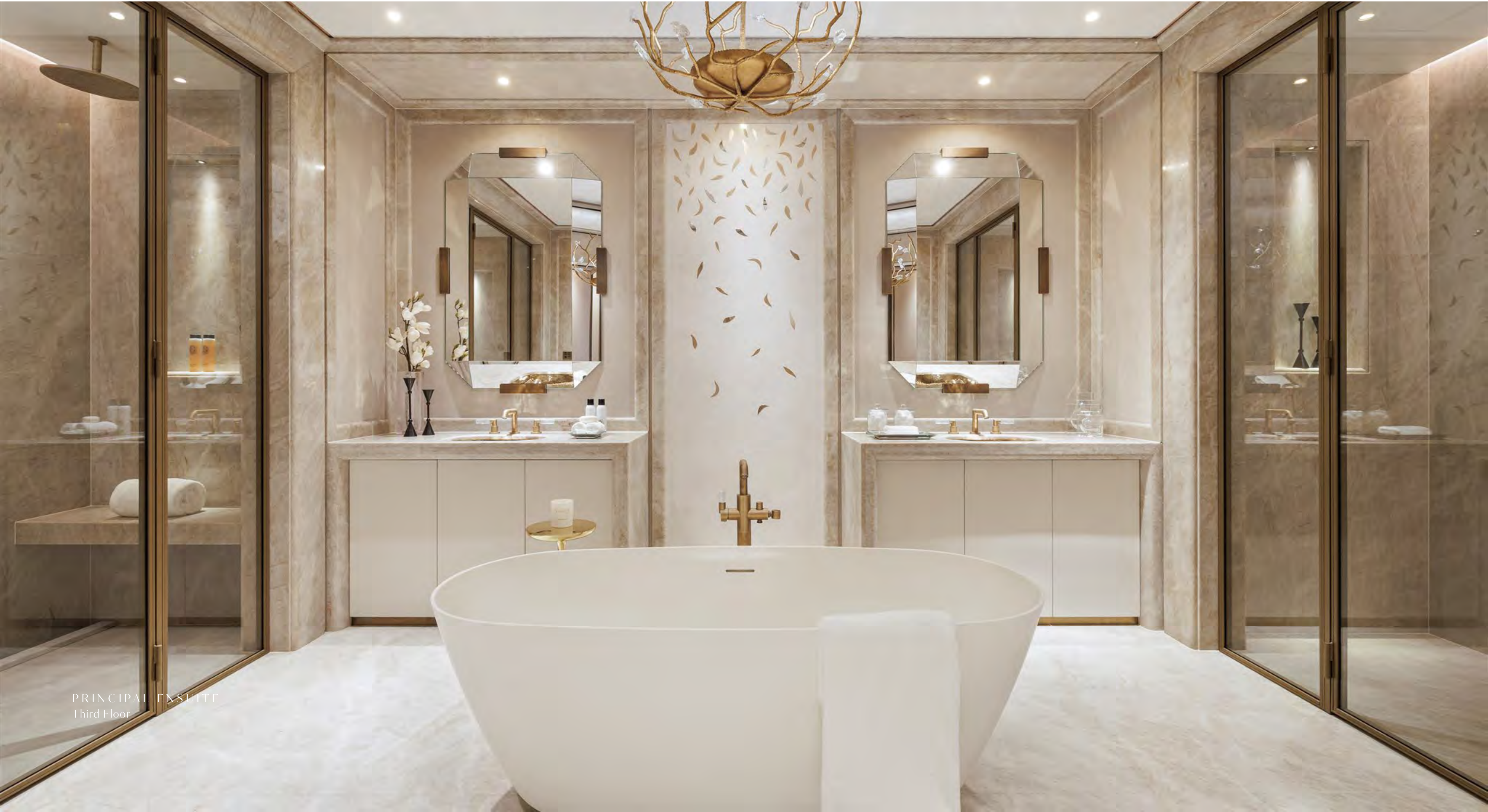
PRINCIPAL ENSUITE Third Floor