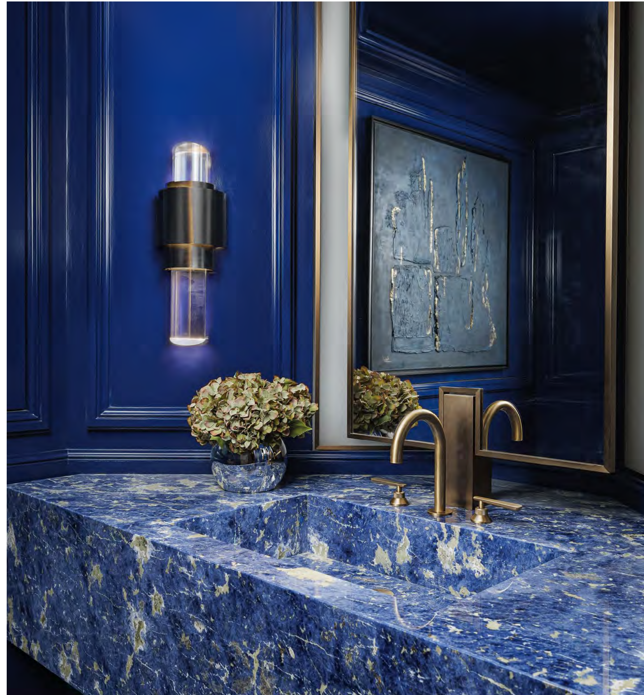
POWDER ROOM First Floor