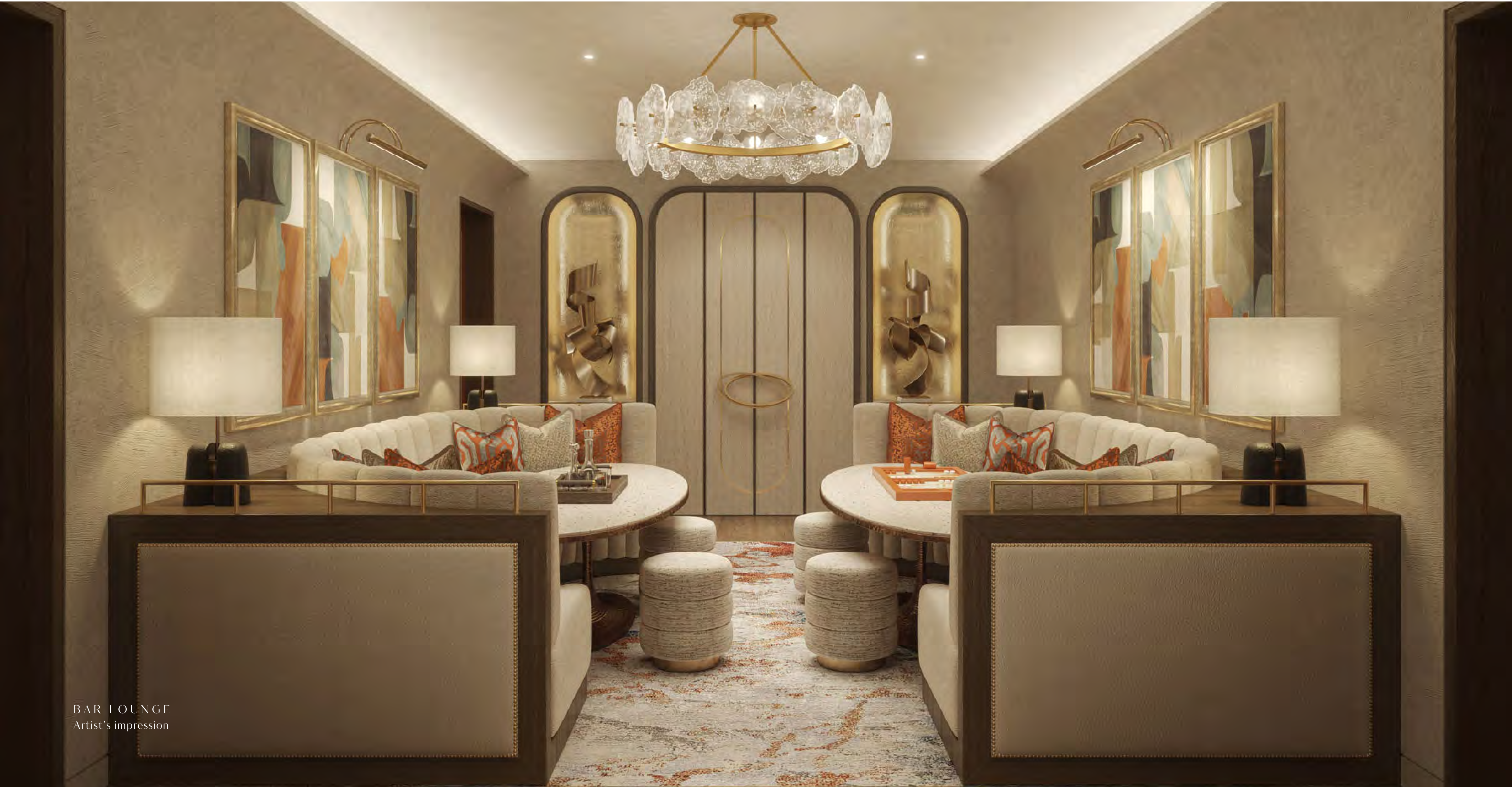
BAR LOUNGE Artist's impression