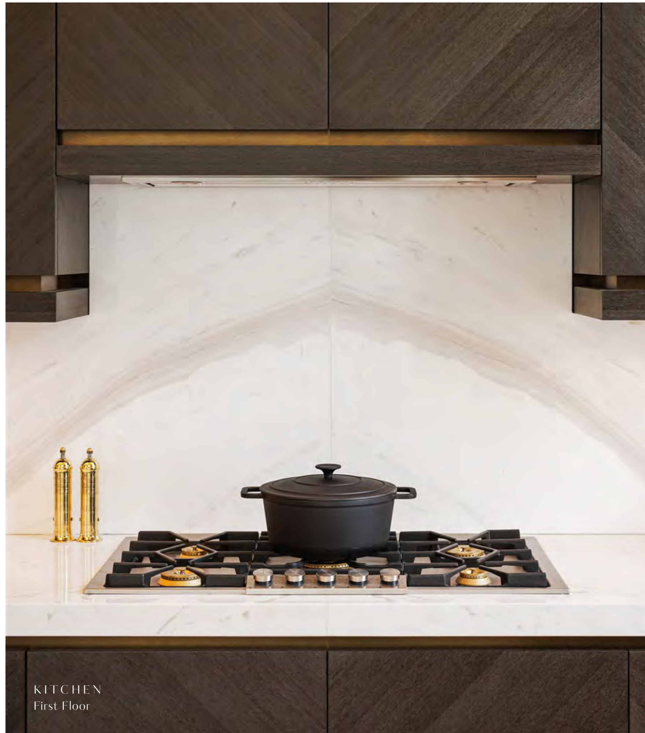
KITCHEN First Floor