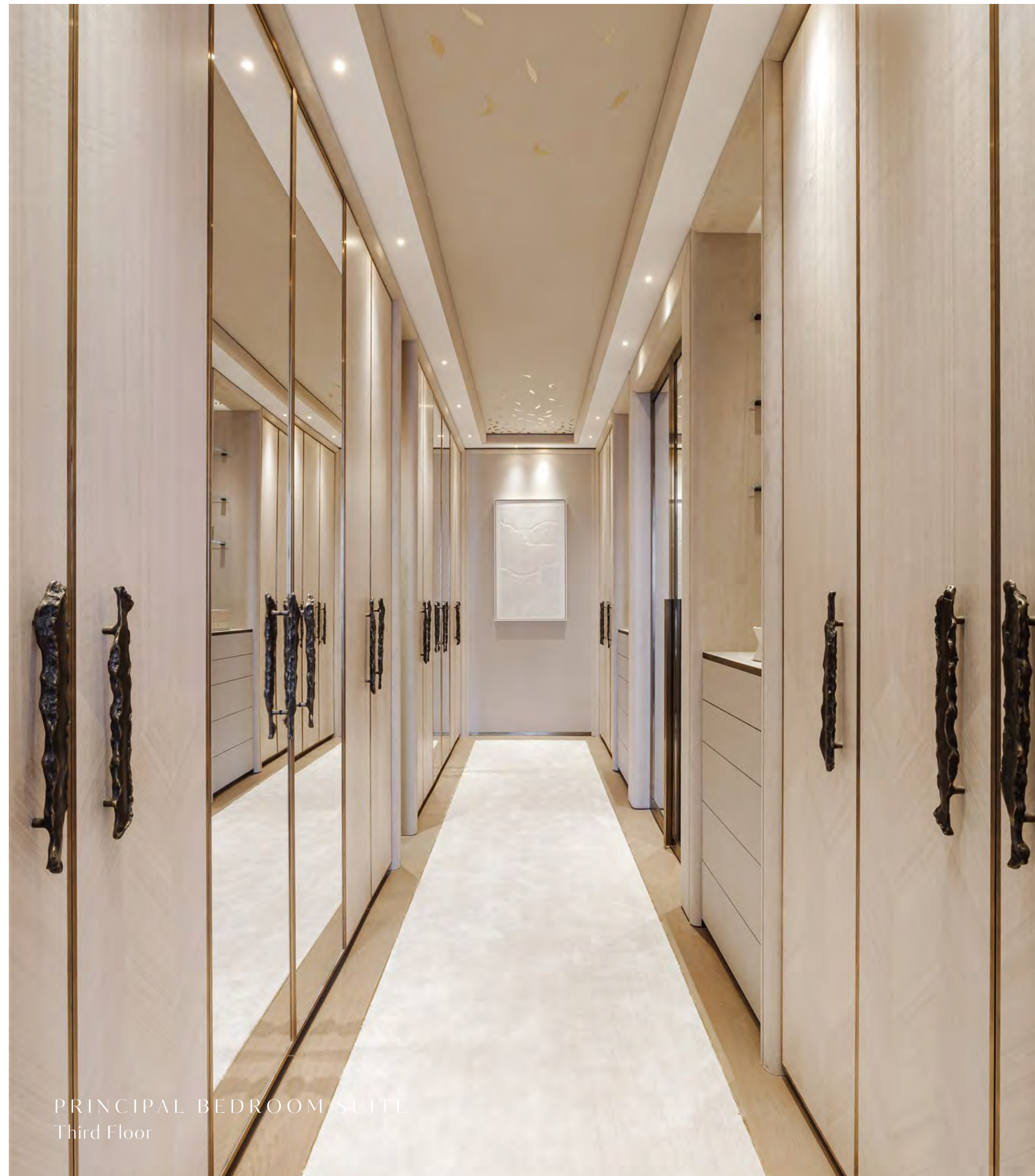
PRINCIPAL BEDROOM SUITE Third Floor