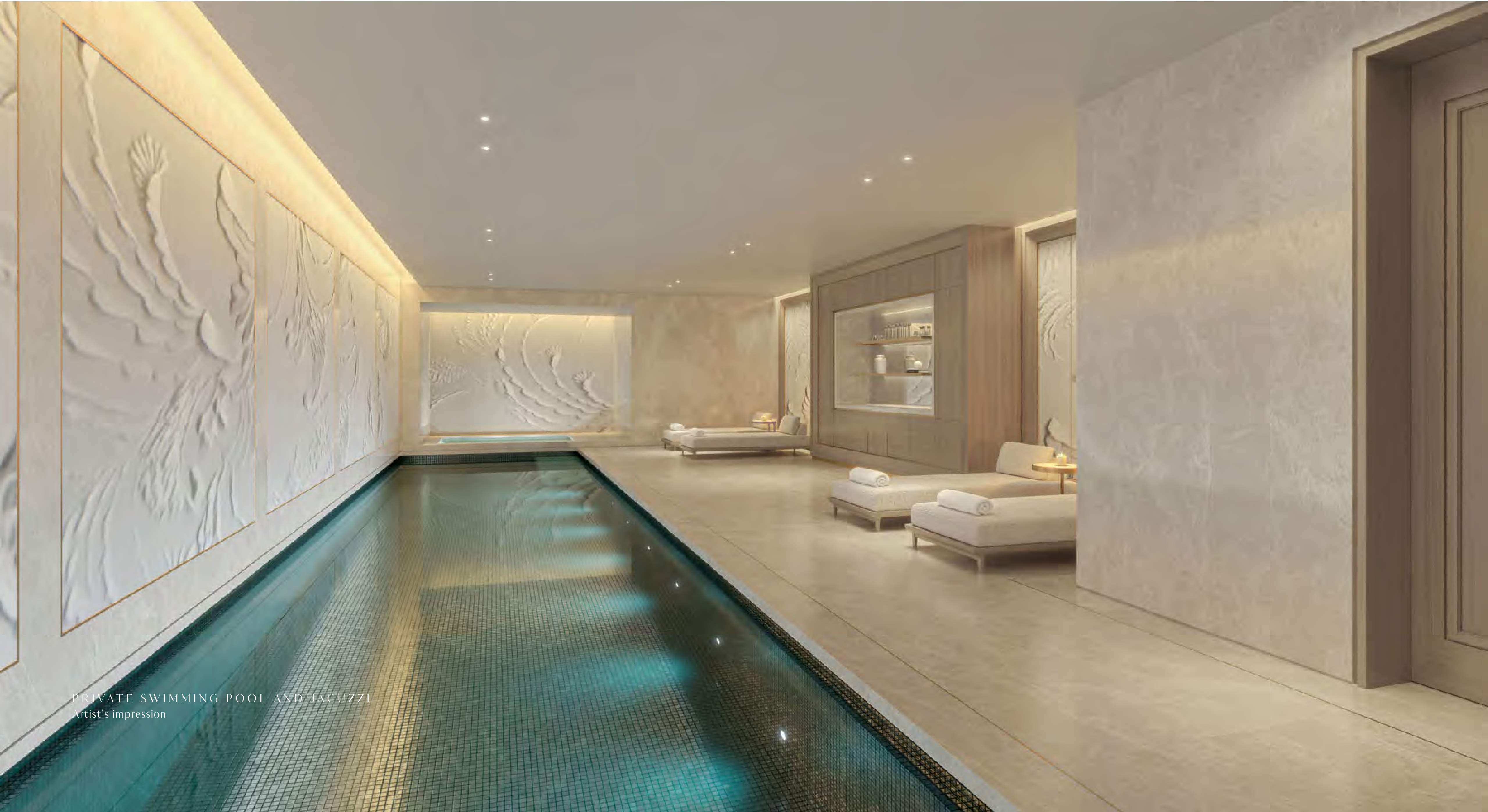
PRIVATE SWIMMING POOL AND JACUZZI Artist's impression