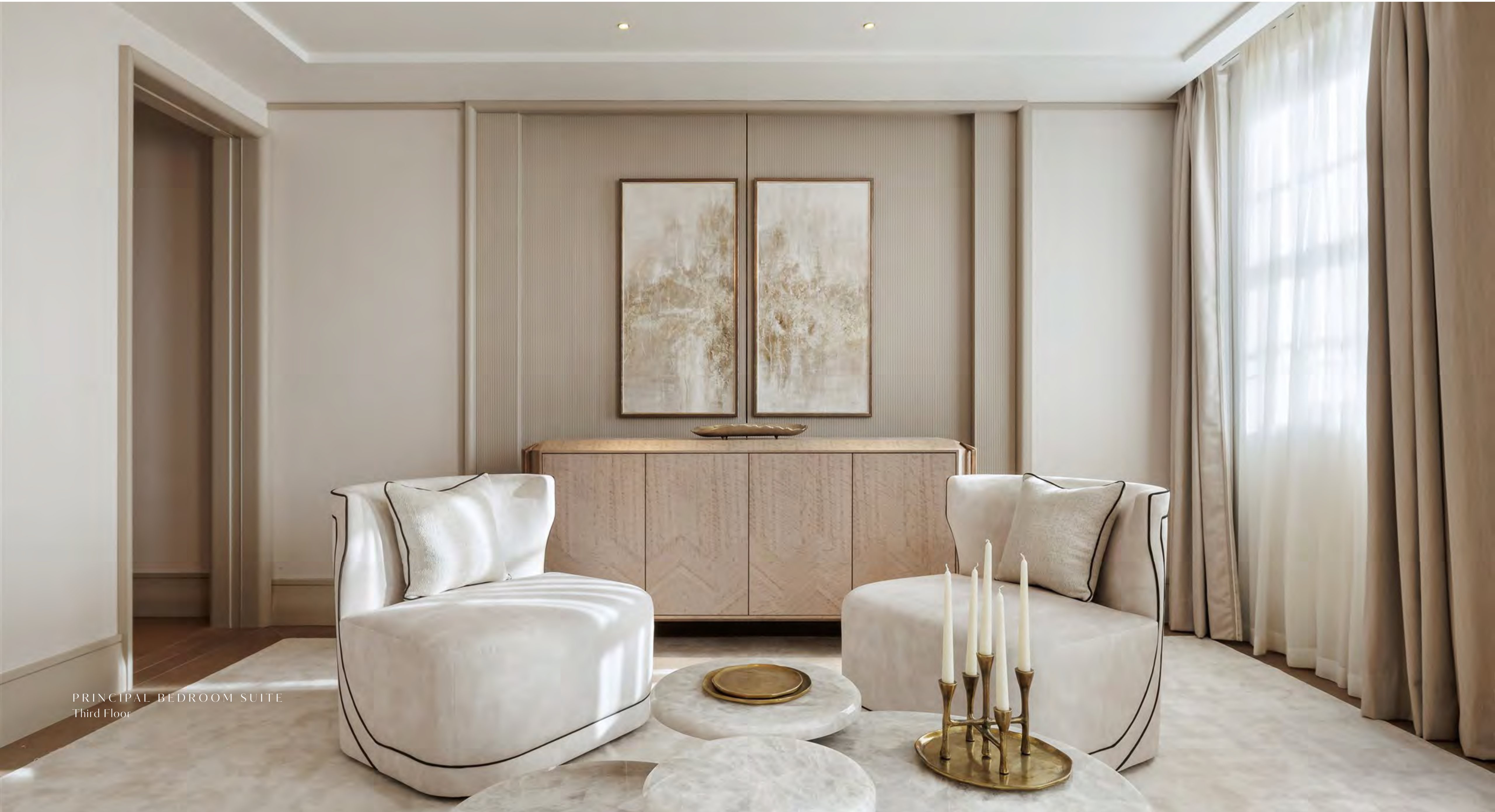
PRINCIPAL BEDROOM SUITE Third Floor