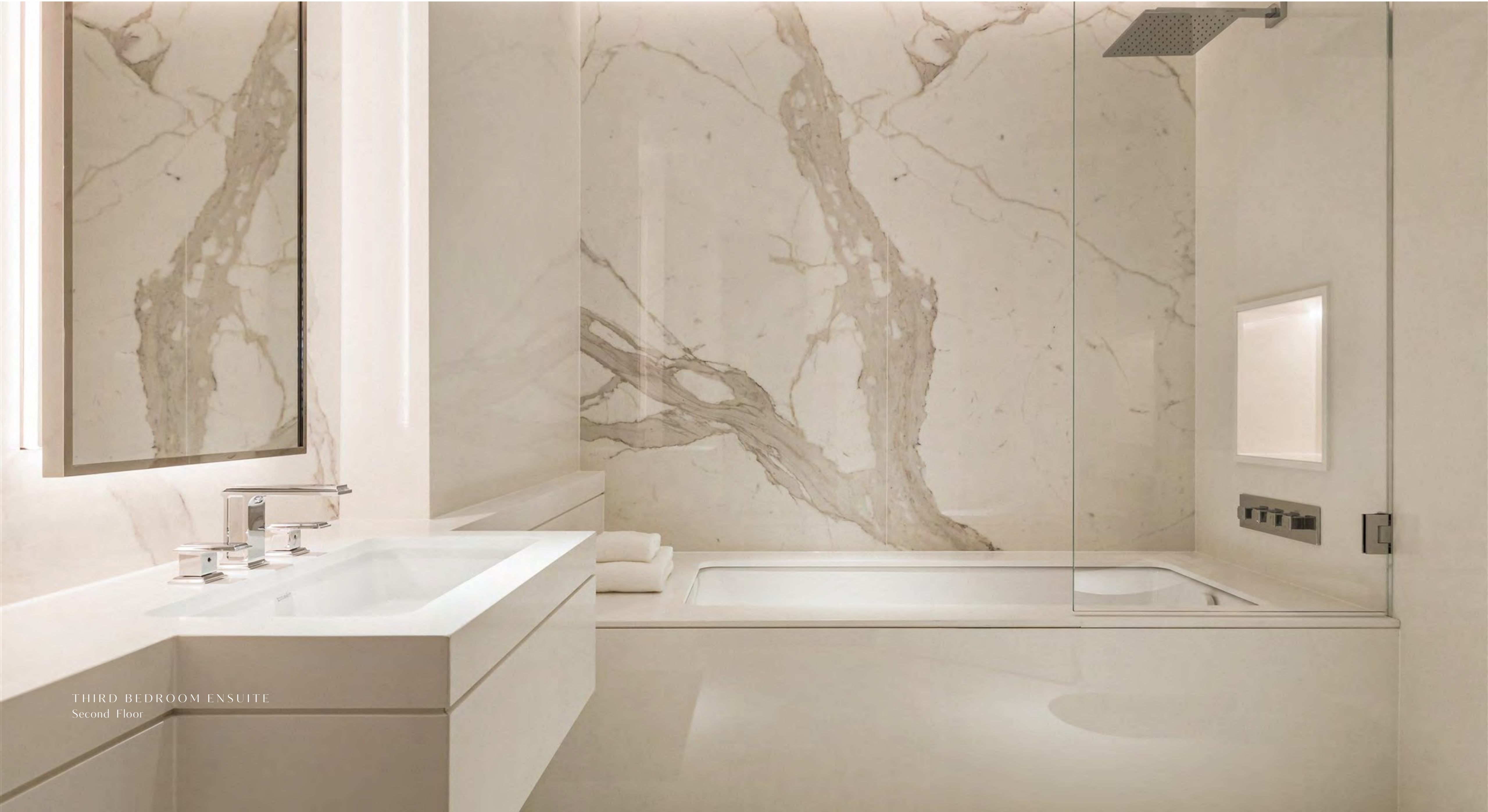
THIRD BEDROOM ENSUITE Second Floor