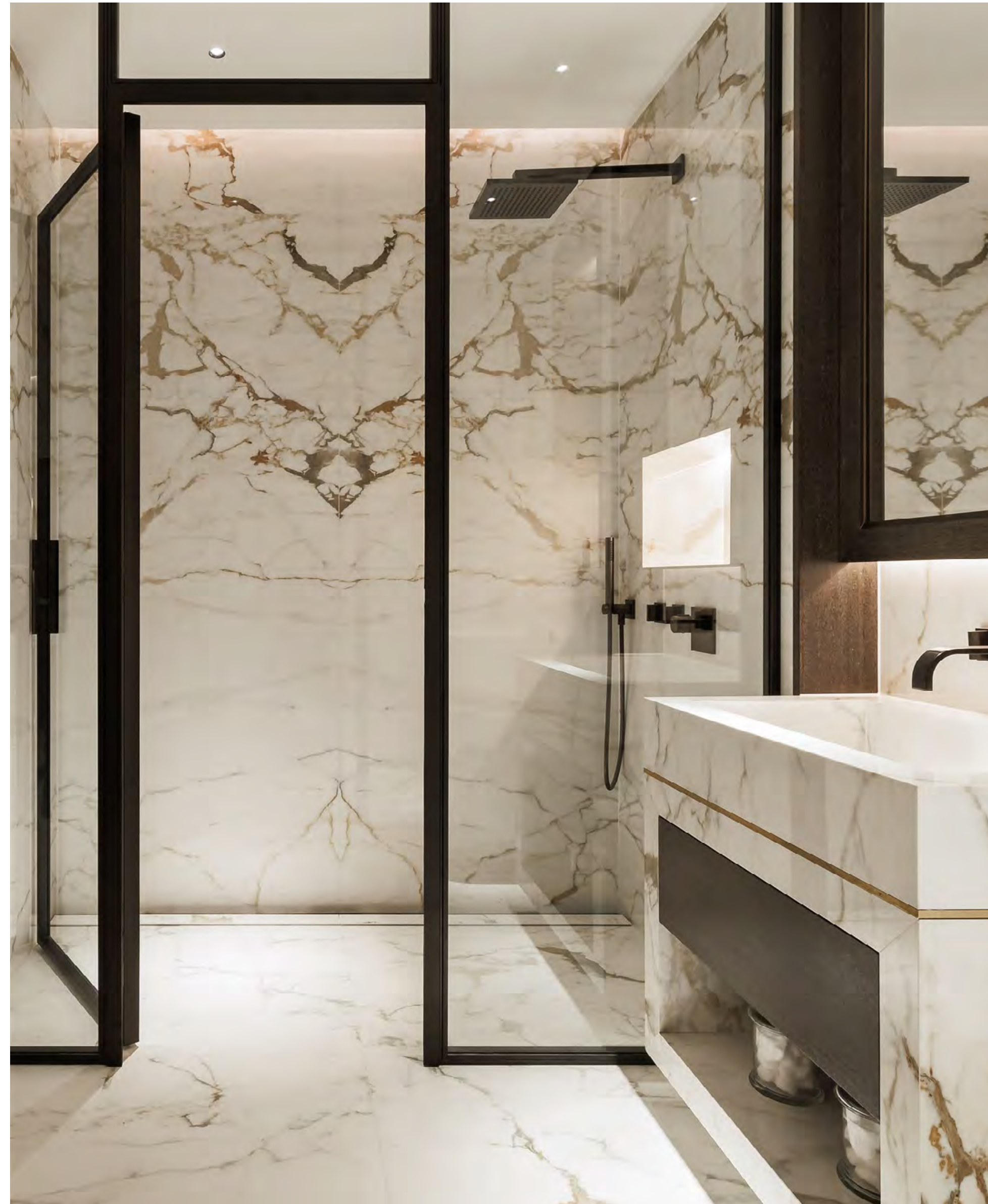
SECOND BEDROOM ENSUITE Second Floor