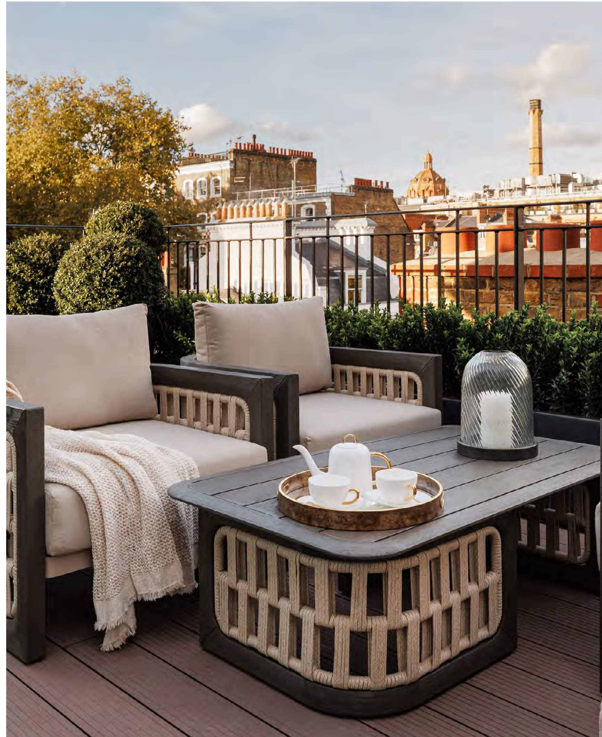
ROOF TERRACE Third Floor