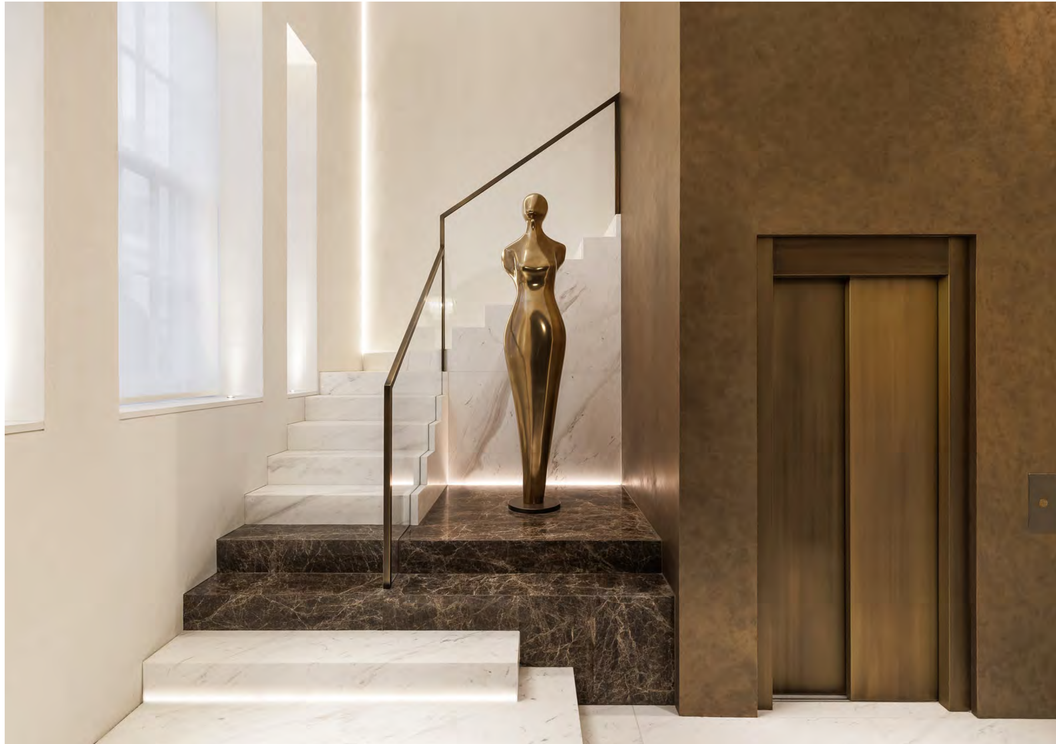
ENTRANCE HALL Ground Floor