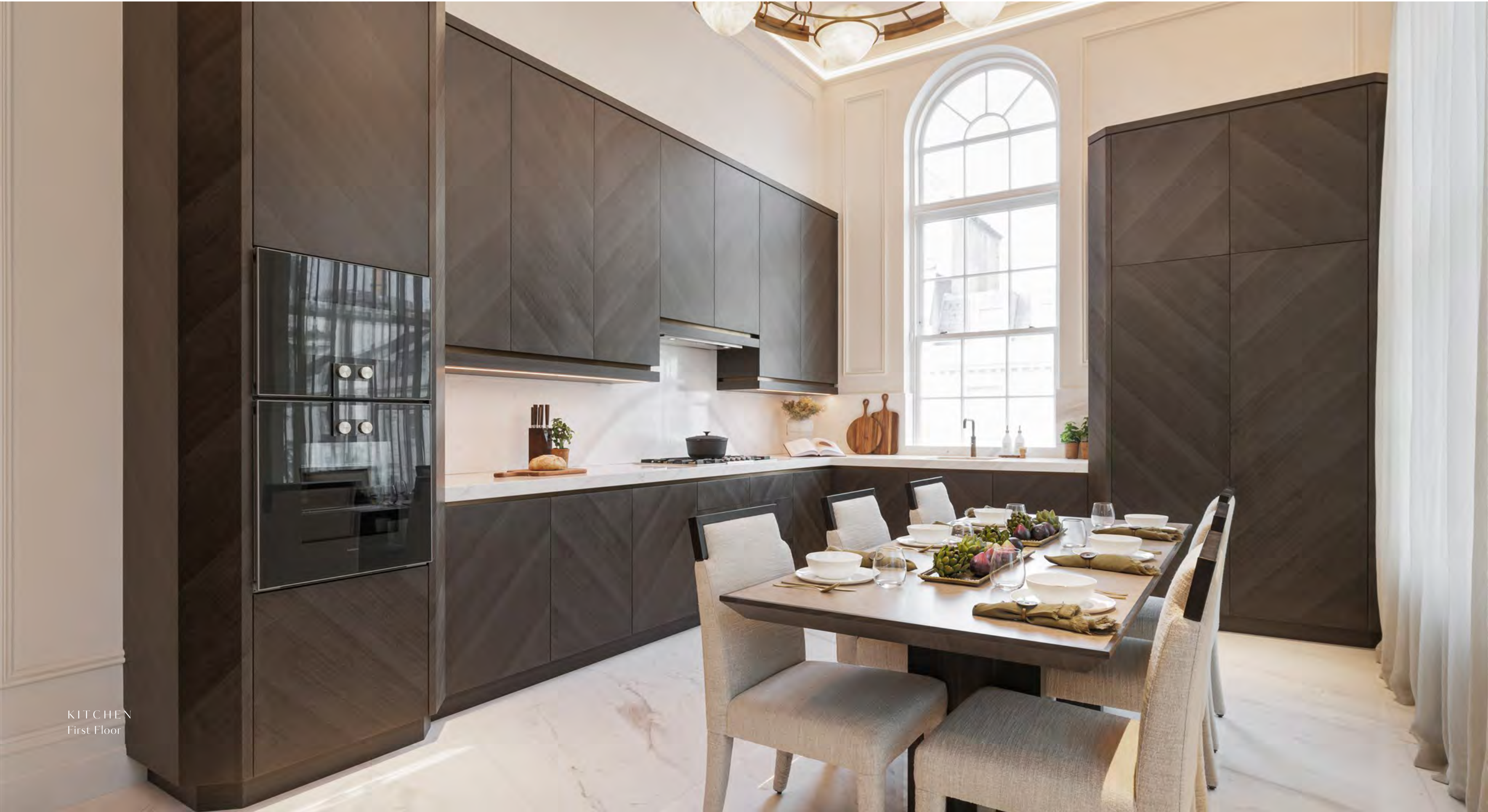
KITCHEN First Floor