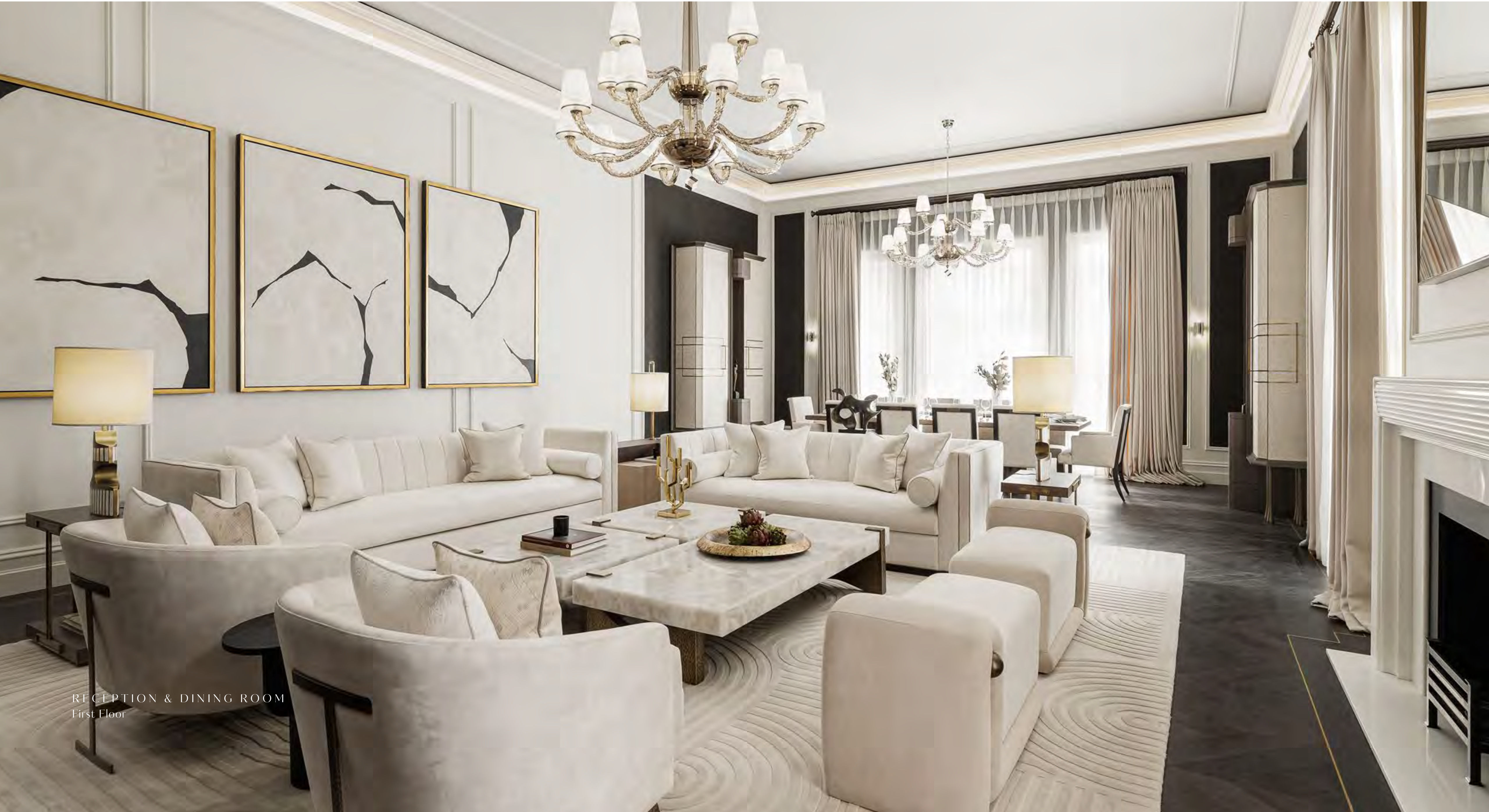
RECEPTION & DINING ROOM First Floor