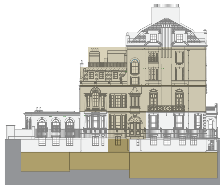
WALTON STREET ELEVATION