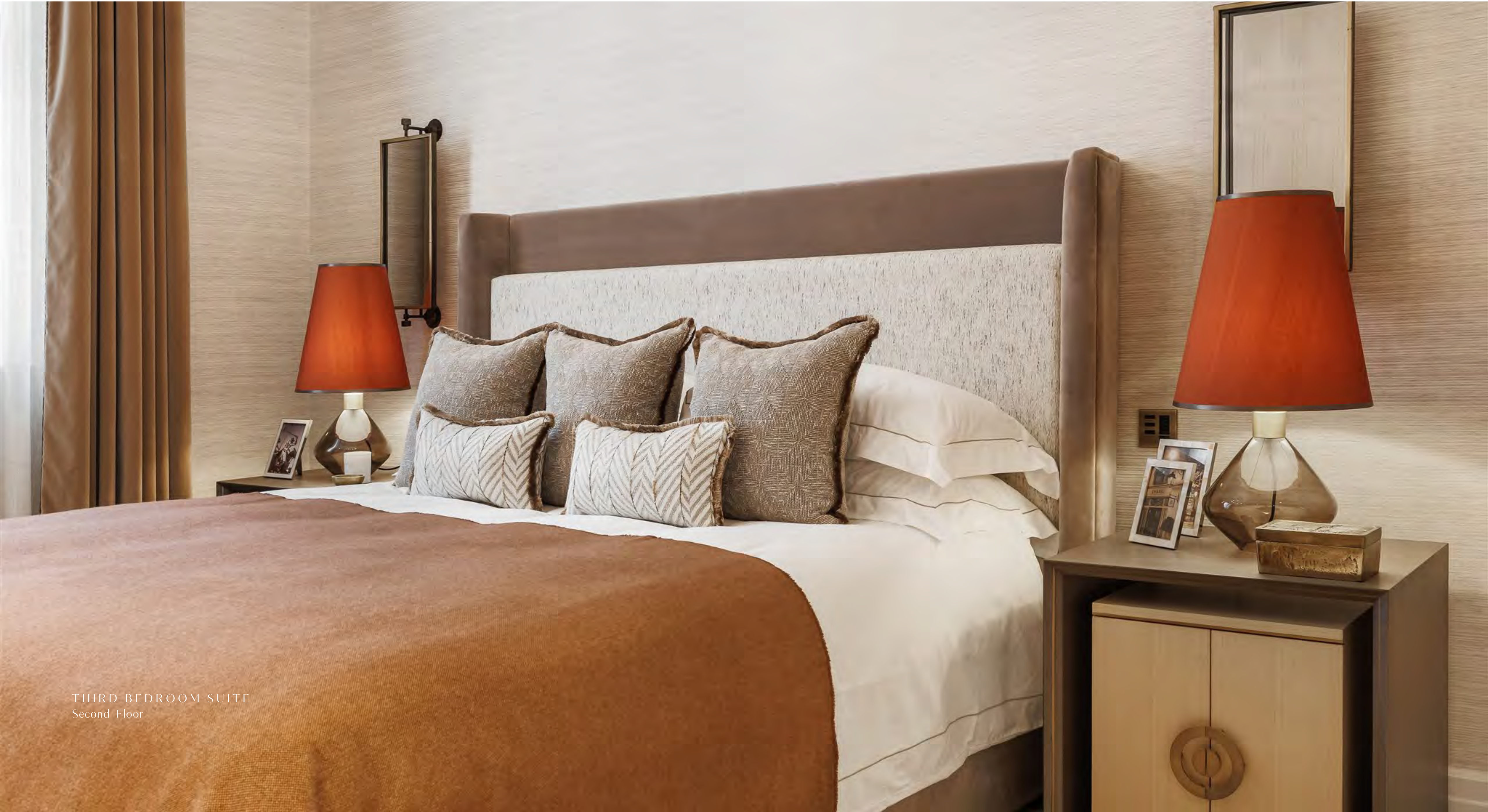
THIRD BEDROOM SUITE Second Floor