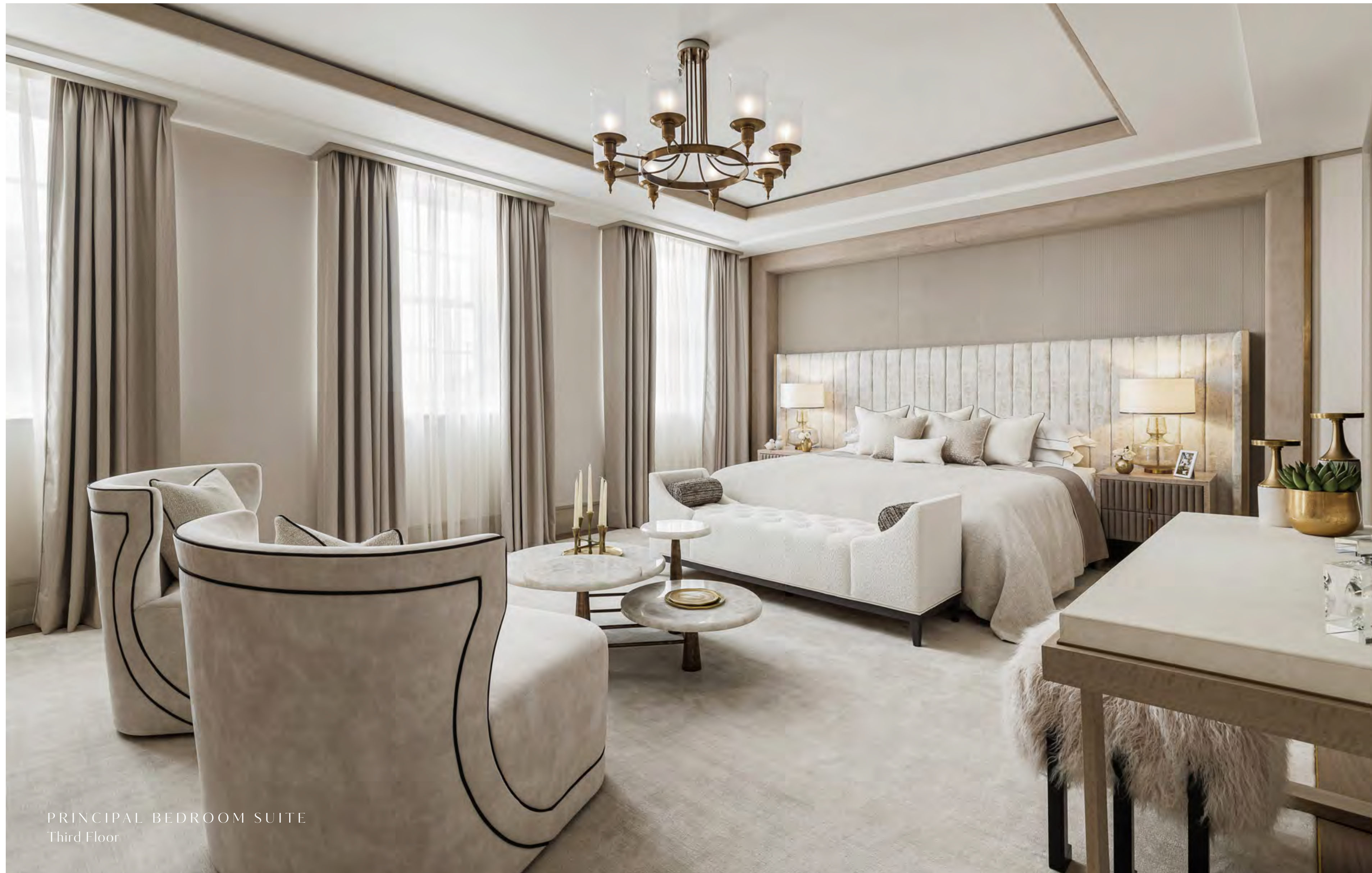
PRINCIPAL BEDROOM SUITE Third Floor