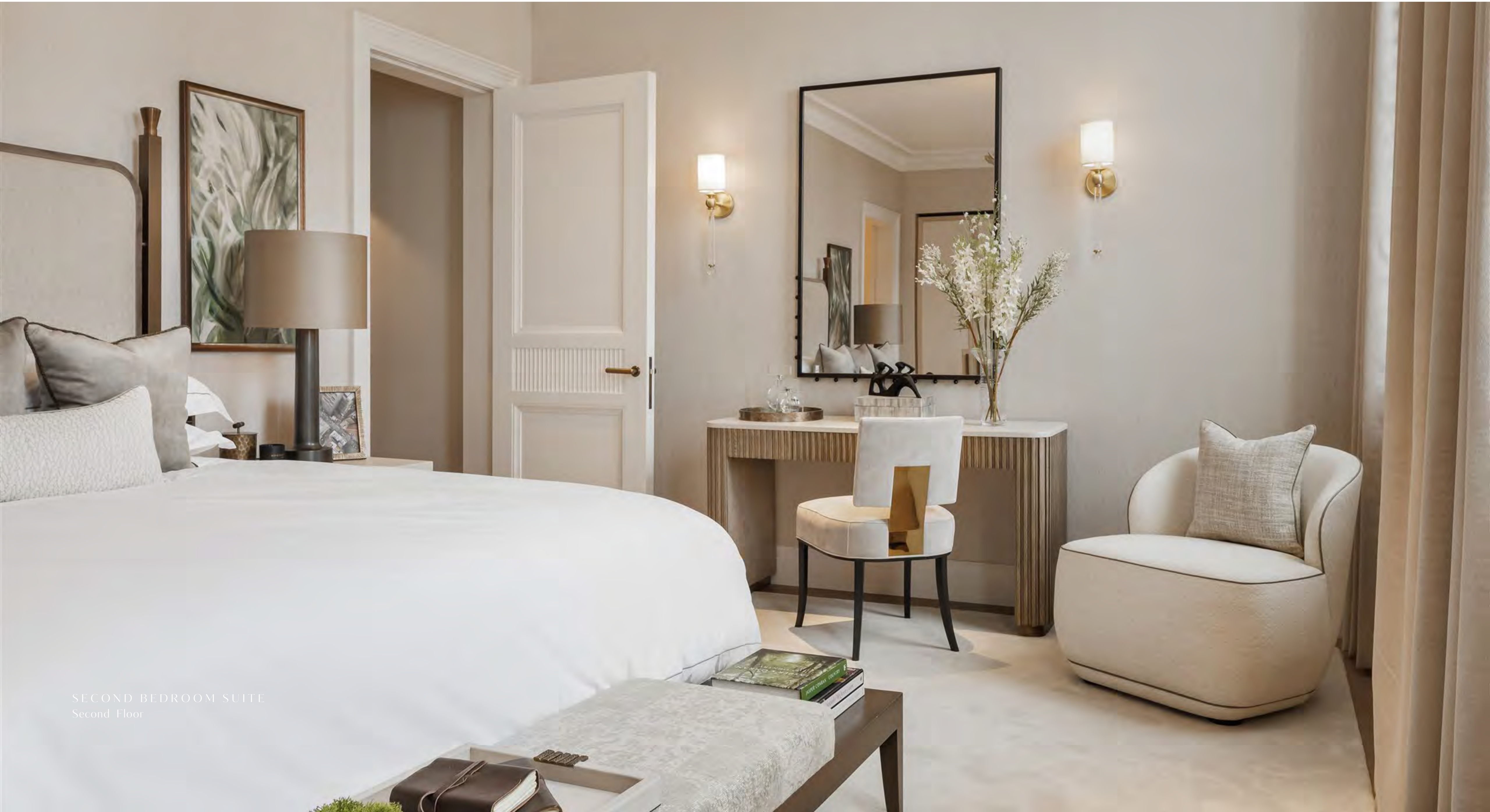
SECOND BEDROOM SUITE Second Floor