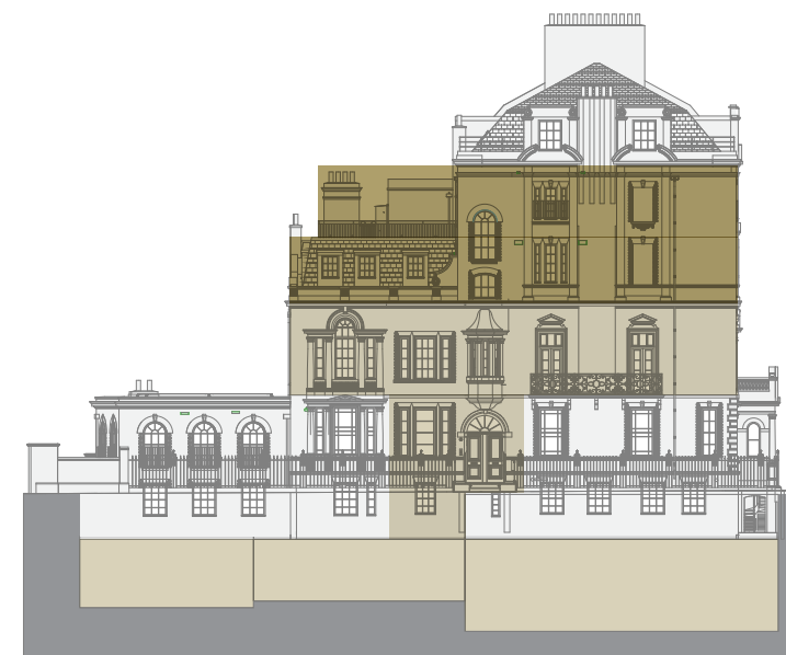
WALTON STREET ELEVATION